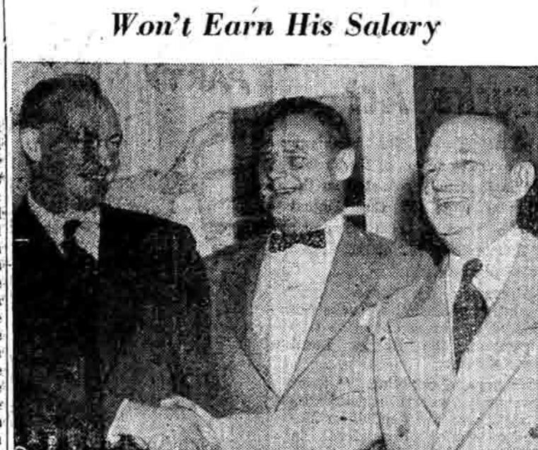
Appointed new price stabilizer by Pres. Truman, rent stabilizer Tighe E. Woods (L) shakes hands in Washington with Ellis Arnall, who quit job. In center is economic stabilizer Roger L. Putnam. If Woods "stabilizes" prices no better than Arnall did, then he won't earn a cent of his salary.

The Iranian government of landlords and capitalists and the western imperialist powers that exploit Iran wanted this situation to continue forever, but the people have initiated a powerful movement of revolt, and have even forced the government to take a nationalist line against the British and other foreign imperialists. It is useless to blame this on "Russia" or "agitators." The true facts tell another story: the crimes of capitalism, landlordism, feudalism are at last catching up with the exploiters in Iran. And that's good news for workers all over the world.