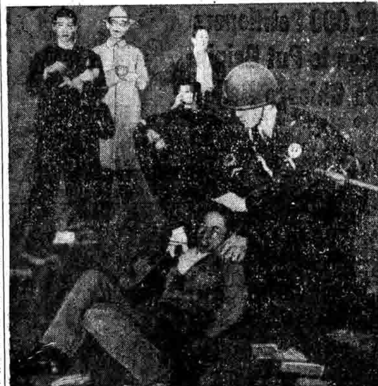
Japanese police beat demonstrators after breaking up labor demonstrations in Tokyo. Similar parades and rallies against the war plans of the Japanese vassals of American imperialism occurred in four large Japanese cities and smaller communities. Three persons were killed and 80 injured.

is restricted to two years to the Province of the Cape of Good Hope.