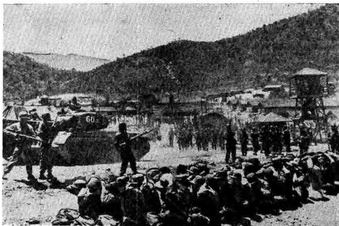
Rifles poised, U.S. troops stand over North Korean prisoners of war as they sit outside one of large compounds on Kojima Island. Forty prisoners were killed and many more injured when American soldiers, armed with tear gas, bayonets, grenades and flame-throwers were commanded to break up compound.