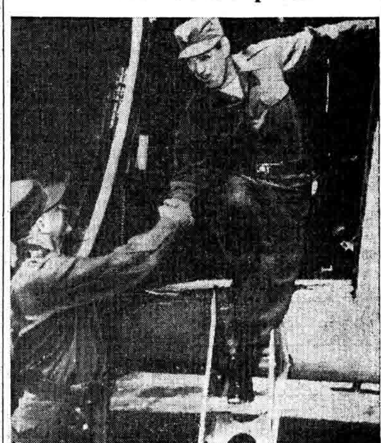
This is the general who helped spill the beans about the murder-policy of the U.S. in Kojé prison camps. Brig. Gen. Dodd, shown here returning to the Korean mainland following his release by Kojé Island prisoners, had agreed to "stop killing prisoners," and made other concessions since violated by Gen. M. Clark.