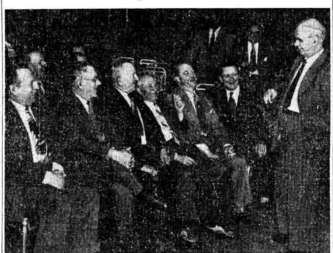
Members of United Steelworkers International Executive Board laugh at a quip of Pres. Philip Murray during union convention at Philadelphia. Later, Murray told the delegates to the convention of the powerful CIO union that a strike would be called unless the dispute is settled speedily.