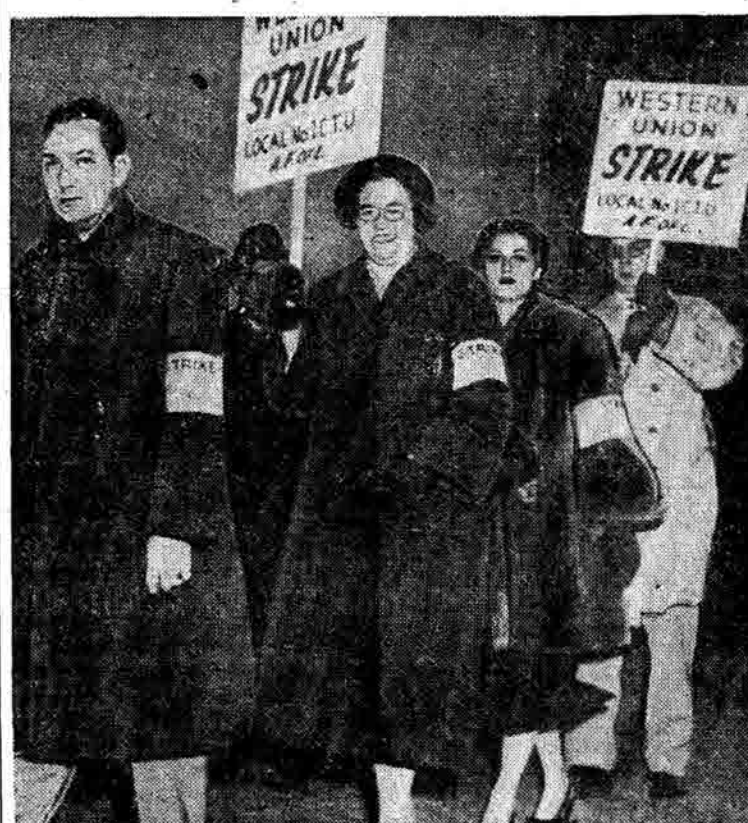
Picket line outside a Western Union office in Chicago where members of the AFL Telegraphers Union are supporting the national strike of 31,000 members. The walkout began April 3 to enforce demand for a reduction of the work week from 48 to 40 hours with no reduction in weekly pay. The company rejected the union's offer of arbitration and the union turned down the company's bid for a 60-day truce.

about war appears. They ran as "workingmen with the support of business organizations."