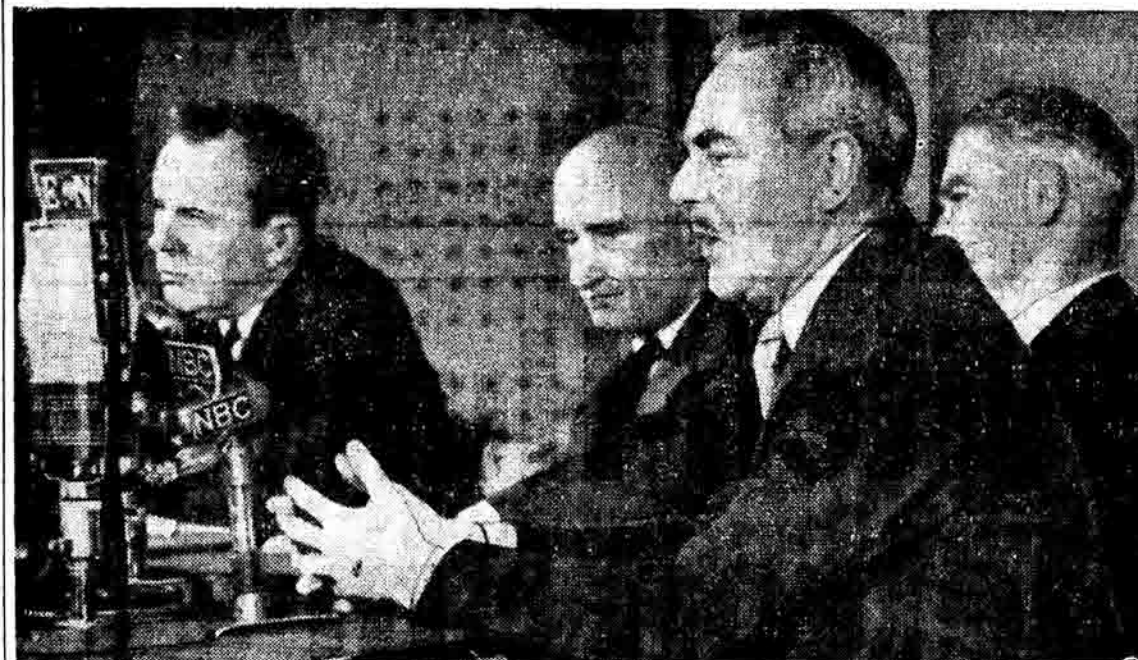
Dean Acheson, U.S. Sec'y of State, shown addressing Lisbon conference of North Atlantic Treaty powers where plans were made to give German capitalists a big role in European armament. German capitalists are pressing for revival of German imperialism as price of joining anti-Soviet alliance. Listening are (l. to r.) Lester Pearson, Canada, Robert Schuman, France, and Anthony Eden, Great Britain.