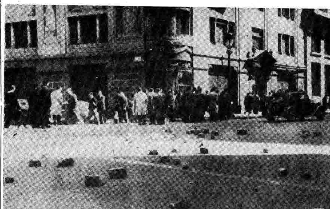
A view of cobble-strewn street intersection Barcelona, Spain, just after fascist police killed two demonstrators during general strike on March 12.

The Militant, which headlined the Barcelona struggle last week, has since received reports from