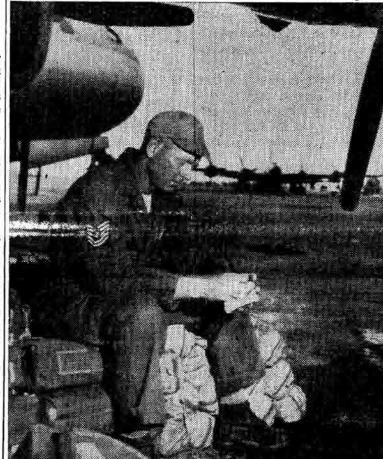
Seated beneath the wing of a B-29, an Air Force sergeant writes a farewell letter to the folks at home just before taking off for the Far East and possible action in the skies over Korea. He was aboard one of the 30 superfortresses that left March Field for Japan.