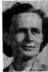
Candidate for U. S. Vice-President