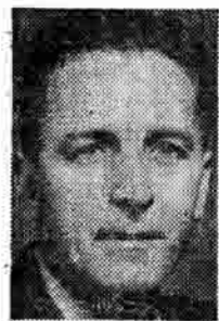
Candidate for U. S. President