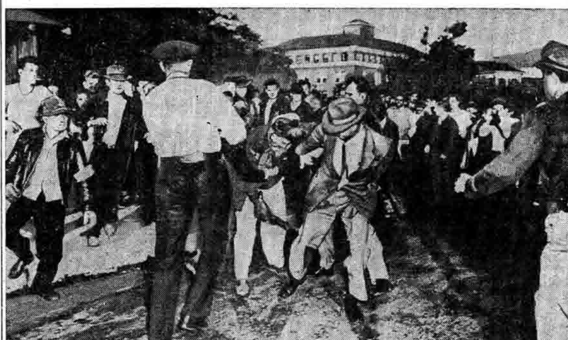
Police attack the picket line for the second time in the current strike of the CIO Oil Workers against the Standard Oil Company in Richmond, Calif. Four pickets were arrested on charges of "inciting to riot."