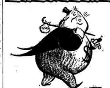
Tax the RICH, not the poor!