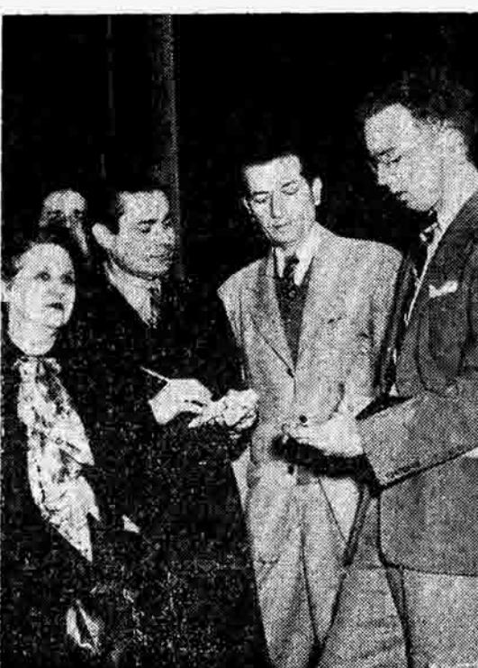
A reporter from the Yale Daily News interviews members of Local 6, AFL Hotel and Club Employees Union, now striking against the Harvard club in New York, for a 40-hour week and increased wages.

ists — is no less reprehensible. The Stalinist flunkies are working with might and main to deflect the workers' powerful urge to build their own political party — into the blind alley of the Wallace third capitalist party adventure. Their crime against the working class is here no less than their previous betrayals when they used their influence to hogtie the labor movement to the Roosevelt administration.