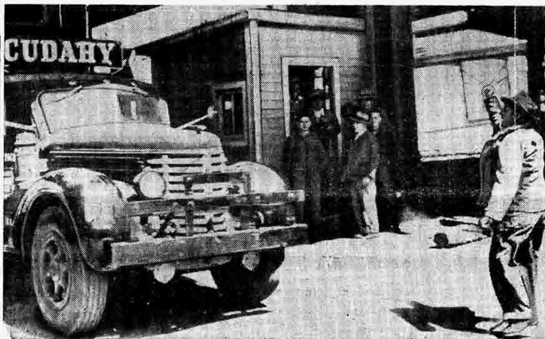
A truck bears down on a picket line outside the Cudahy meat packing plant in Kansas City where the CIO Packinghouse Workers have been striking for five weeks.