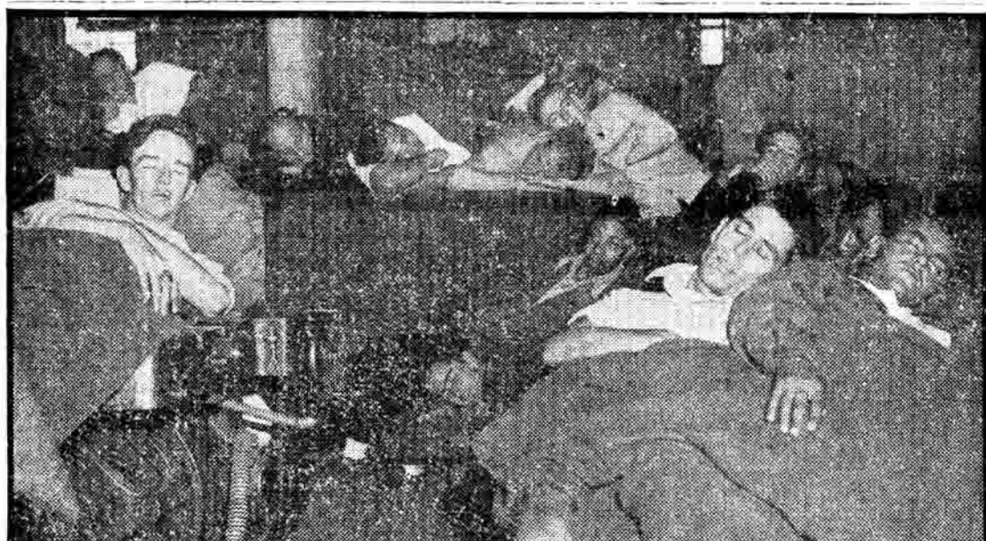
Here are some of the more than 90 members of Local 65 of the CIO Wholesale and Warehouse Workers who refused to quit the plant after the Brooklyn Industrial Confiner shut off the power and ordered them out. The sitdown was precipitated by the lockout of 11 of their fellow unionists. They left the plant after a week when an injunction was handed down against them, and set up a mass picket line. New York police helped scabs to crash through the line.