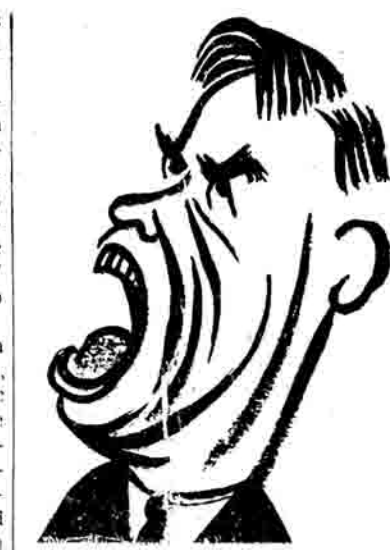
WORKING people to separate the means of production from their present parasitic owners. After expropriating the monopolists, the working people themselves must then take over the control and management of the plants and factories. This is a genuine trust-busting program. There is no other.

The trusts will not be reformed by "criticisms" or sermons from New Dealers and "progressives." The first step toward abolishing the power of the trusts is for the