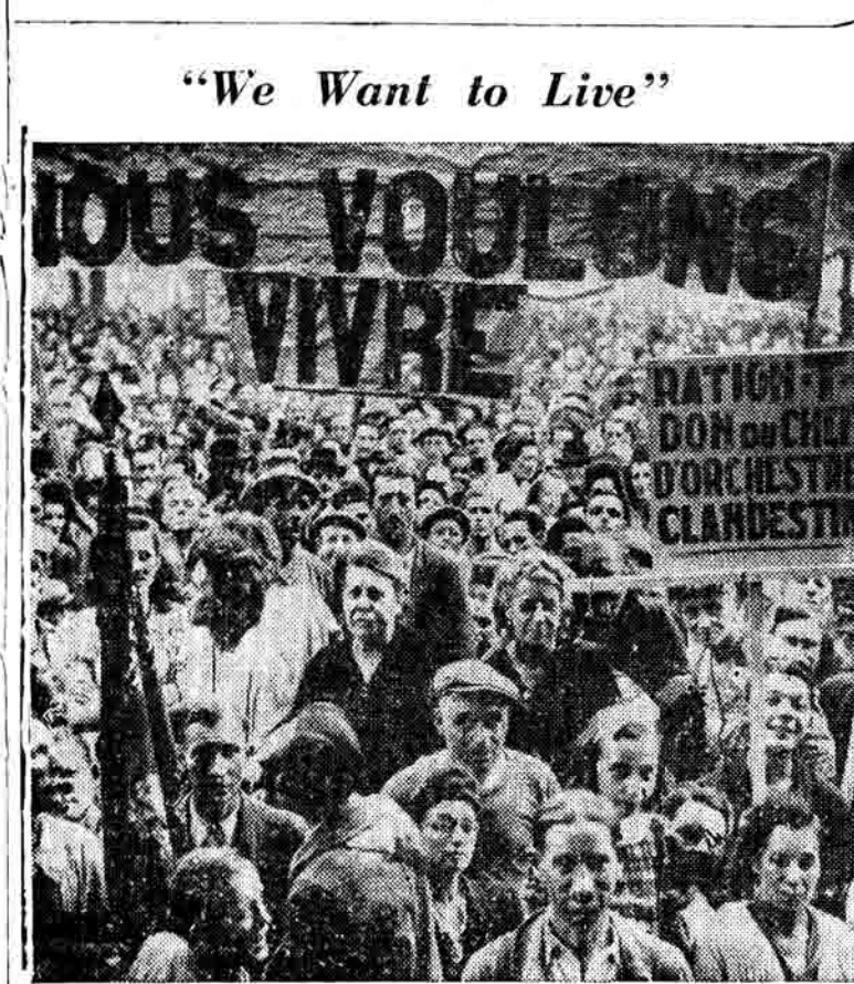
That's what the sign says as thousands of French workers protest rising food prices and demand effective action to curb inflation.