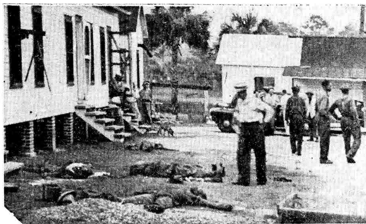
The bodies of four of eight Negroes killed at this Brunswick, Ga., prison camp are sprawled on the ground. The warden it is reported, shouted: "Let 'em have it," and the guards shot to kill. An investigation is under way; already it has been revealed that the warden was drunk.