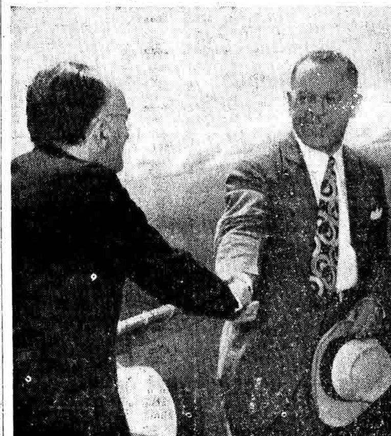
Appointed as administrator of U. S. military aid to the Greek tyrants, Dwight Griswold leaves for Athens on President Truman's private plane. 35 million dollars worth of American arms are now en route to aid slaughter of the workers and peasants opposed to the Greek dictatorship.