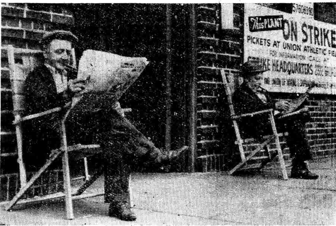
As members of the CIO Industrial Union of Marine & Shipbuilding Workers remain solid in their strike against major ship companies, mass picketing has stopped in many places with token pickets doing the job. These two at this Camden, N. J. shipyard look very comfortable with their chairs, newspapers and cigars.