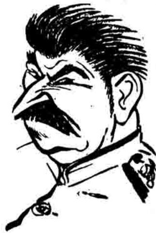
STALIN Praises "Militant" For Exposing Stalin