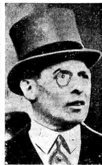
This mother and her starved, barefoot children (left) are typical of the suffering masses in Greece. They want bread and freedom, and they are denied both by the monarchist police dictatorship headed by King George II (above).

British money and troops have helped to keep the monarch and his anti-labor regime in power, but because of trouble at home the British imperialists will have to reduce this "commitment" after March 31. Truman wants the American government to take over this job then. Those who want to continue to prop up King George's dictatorship will support Truman's plan. Those who want to help the starving Greek masses will oppose it.