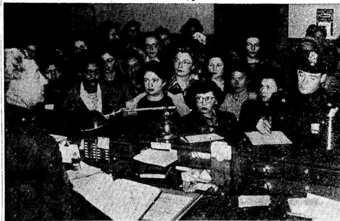
While picketing the Brooklyn YWCA, these members of CIO Local 19, United Office & Professional Workers were arrested and charged with disorderly conduct. The union immediately announced another picketline for the following day and intends to continue picketing until the YWCA settles.