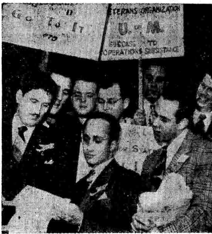
Ex-GIs, representing 19 different Michigan colleges, preparing to leave for Washington, D. C., carrying petitions bearing thousands of signatures. They are demanding more subsistence pay for students which today is only $65 a month for single veterans, $90 for a married couple.