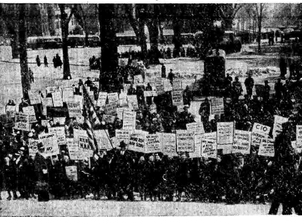
Republican Governor Dewey's reply to this delegation which marched on Albany, N. Y. to protest the housing shortage, was to utilize state troops to prevent their entering the state capitol building.