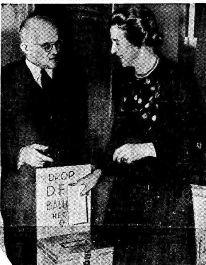
High school teacher in Detroit casting her ballot when the Detroit Federation of Teachers, AFL voted 4,108 to 1,717 for strike action "in the event everything else fails."