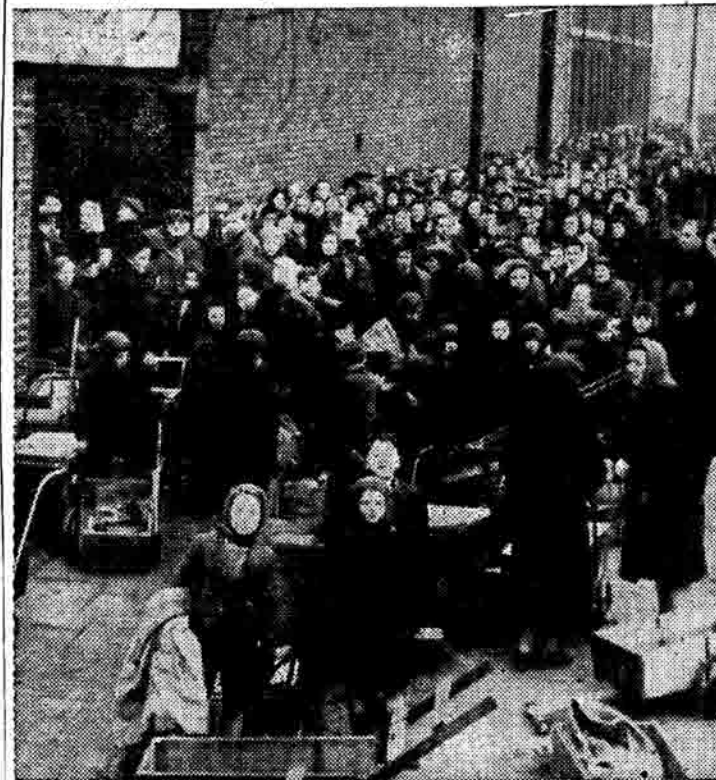
Londoners waiting in line for coal, during the current economic crisis. This is the gravest economic breakdown in the history of British capitalism.

LONDON, Feb. 14 — Trinidad workers in the oil fields, waterfronts and public works have been engaged in recent months in a series of bitter struggles for decent wages, conditions and elementary freedom. The Governor of Trinidad, Sir Bede Clifford, has vainly denied and tried to conceal the labor struggles, but despite this and outright suppression of news, the facts have seeped through and the British Minister for the colonies has been forced to demand a report in London.