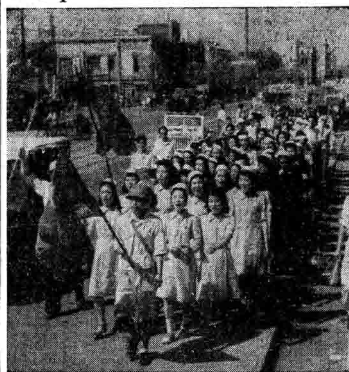
These restaurant workers, employed by a movie studio in Tokyo, parade to celebrate their victory in a strike. Japanese labor continues its militant fight for collective bargaining and better conditions.