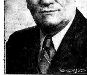
JAMES P. CANNON

The Socialist Workers Party is different from all other political groupings. The Republicans and Democrats are instruments of America's ruling class. They safeguard the profits and special privileges of the tiny minority of Big Businessmen who exploit the vast bulk of the population. We stand 100 percent opposed to these parties and the clique of billionaires they represent.