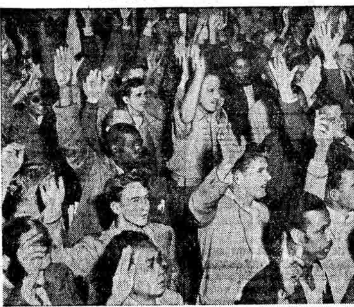
Members of the CIO National Maritime Union in New York voting to "hit the bricks" to win the same pay the AFL seamen won in their national maritime struggle.