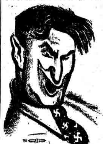
Driven out by Minneapolis workers.