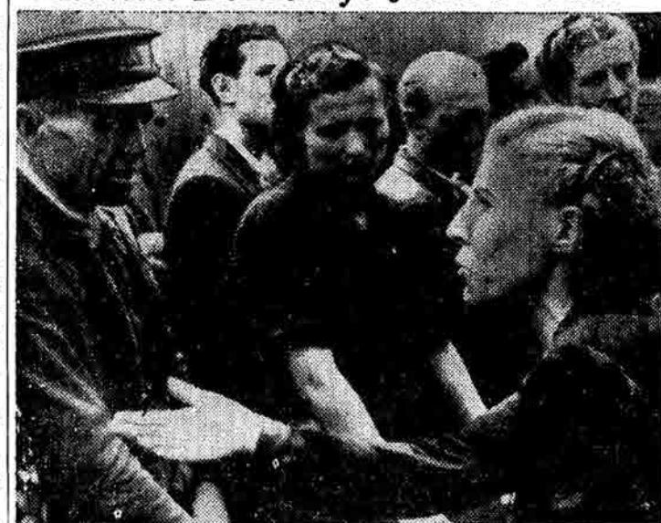
Mass strikes for higher wages halted almost all municipal functions in 28 provinces of northern Italy, as prices soar. Here, a housewife protests to an official, against the hardships of the Italian people.