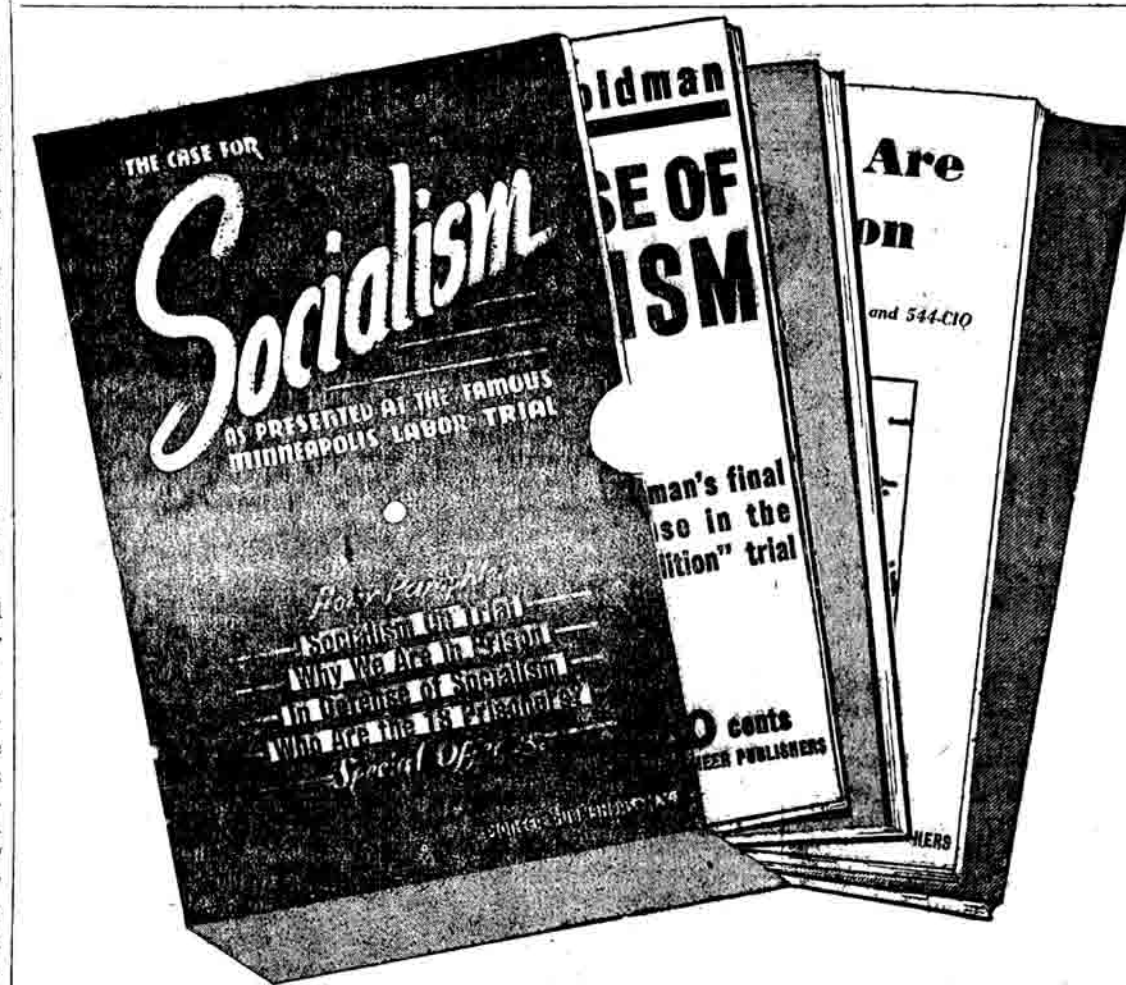
The four pamphlets above, packed in an attractive container, are being offered to new readers of THE MILITANT for only 25 cents, by Pioneer Publishers. The regular price is 40 cents.