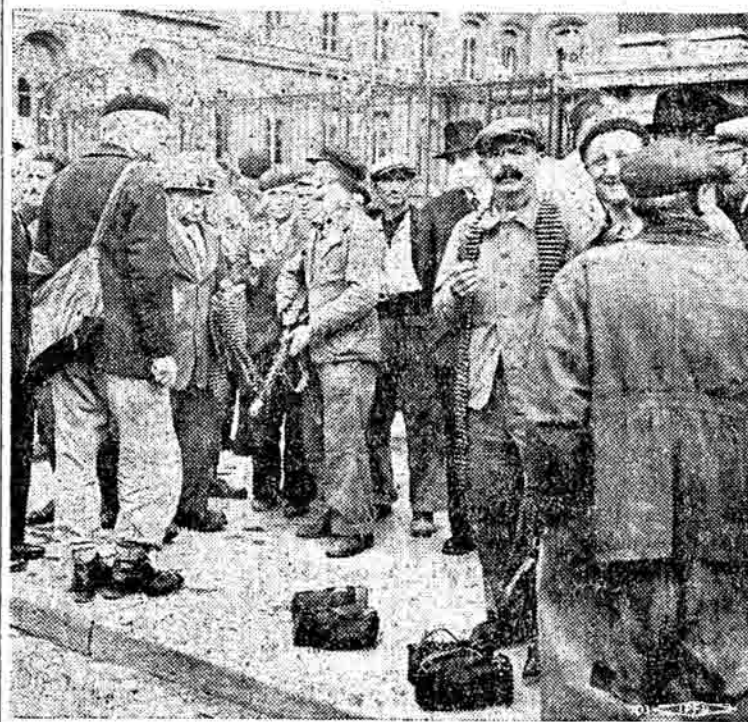
Members of the FFI arm themselves with guns and ammunition captured from Nazi troops in the first days of the French uprising.

and exchange, control of the factory canteen, etc.