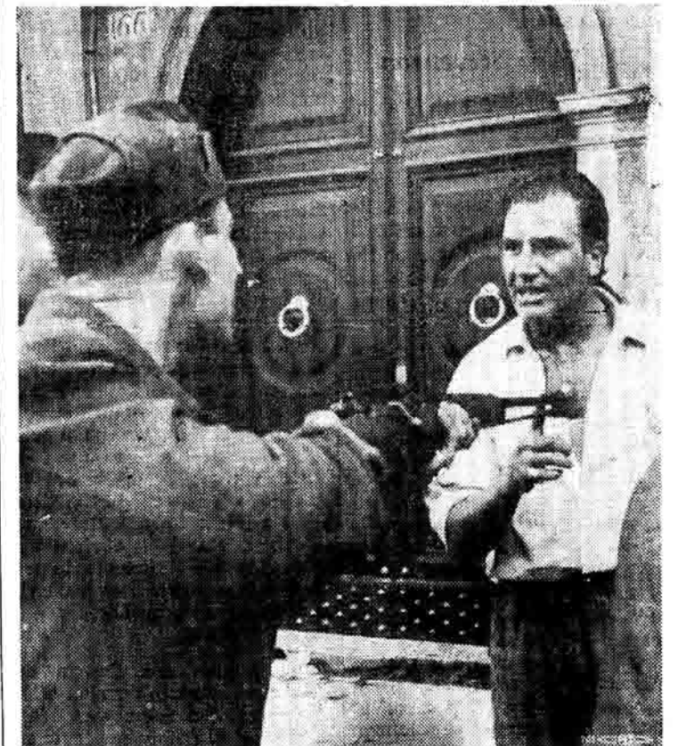
Now that he no longer holds the whip hand, this fascist is not so arrogant. Facing the poised rifle of an anti-Fascist Italian soldier, the fascist, who was seen crawling from under the steel grille in the picture to the left, is trying to explain that it was all a "mistake".

to the Contract Termination Bill has been offered by Senators George and Murray, also based on the Baruch-Hancock report, which is being used to head off the more liberal Kilgore bill which has the support of organized labor, the pro-labor National Farmers Union etc. The Roosevelt administration spokesmen, so lavish with their promises during the Brewster "sit-in" are opposing the Kilgore bill.