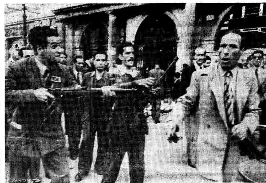
(Above) A fascist crawls out on his belly from his hiding place behind the steel grille under the ready guns of anti-fascist workers in Rome who drove to cover and hunted down their oppressors. (Below) Talking fast, the fascist, seen also in the picture on Page 1, is being marched off to arrest.

and made unprecedented sacrifices, the armies of the Soviet Union literally lifted themselves up by their bootstraps from the ashes of defeat and disaster.