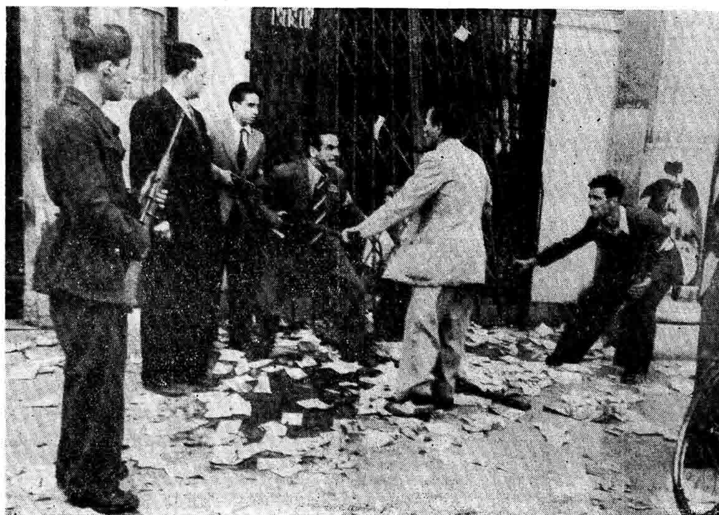
This remarkable photograph, together with others taken at the same scene which are reproduced on Page 3, shows how the armed anti-fascist workers and soldiers fought and hunted down the hated fascists as the Allied armies entered Rome. In the above picture, a fascist is cornered by the workers, whose feelings towards fascism and its minions are clearly revealed in their faces. Another fascist is cowering behind the steel grille of the tobacco shop where he and his colleagues tried to hide.