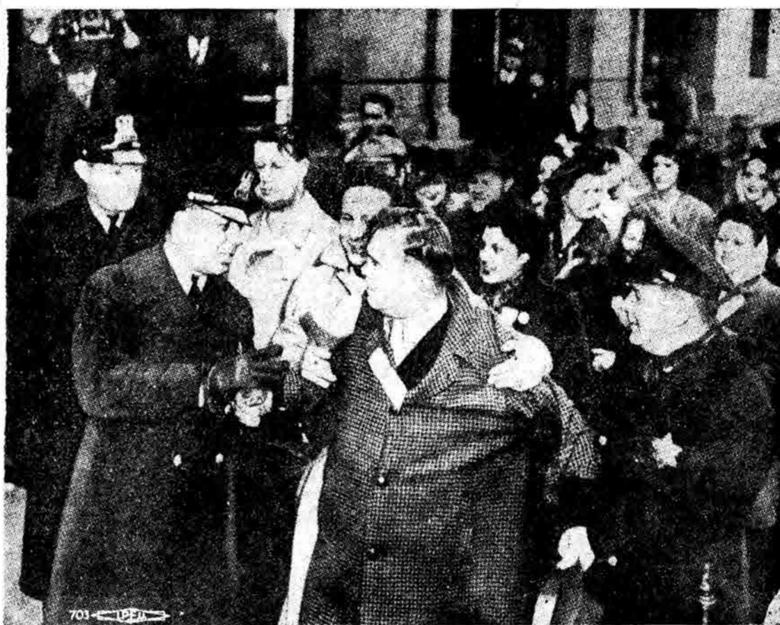
A picket in the Montgomery Ward strike, involving 5,000 Chicago members of the CIO United Retail, Wholesale and Department Store Employees, is held by police when he protested their assistance to a scab trying to pass the picket line.