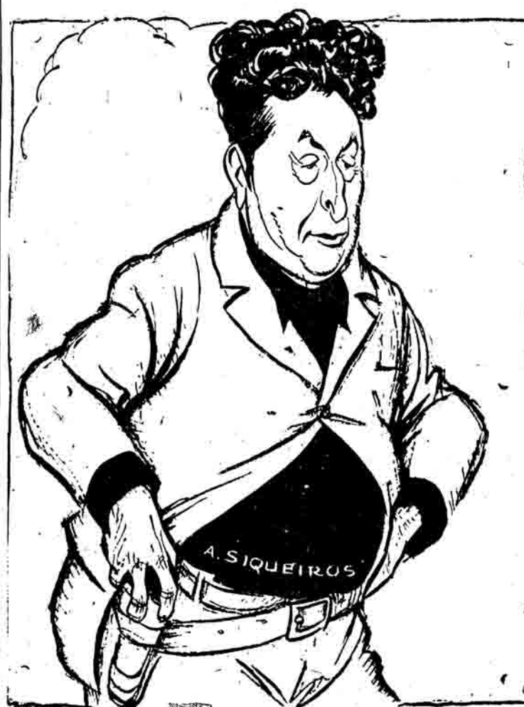
GPU Gunman Siqueiros

Siqueiros even turned back to face us; but he did not listen to what we were saying, and kept a stony silence which prevented us from getting anything more out of him. But at least Excelsior is able today to report exclusively