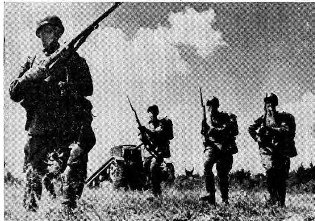
Red Army troops, wearing gas masks, are shown practicing a bayonet attack supported by tanks during maneuvers last spring.

will hear with merited pride the words of greeting from the highest and most authoritative body of the world working class. The Red Army and the Red Navy will not fail to meet the expectations and hopes of the Communist International.