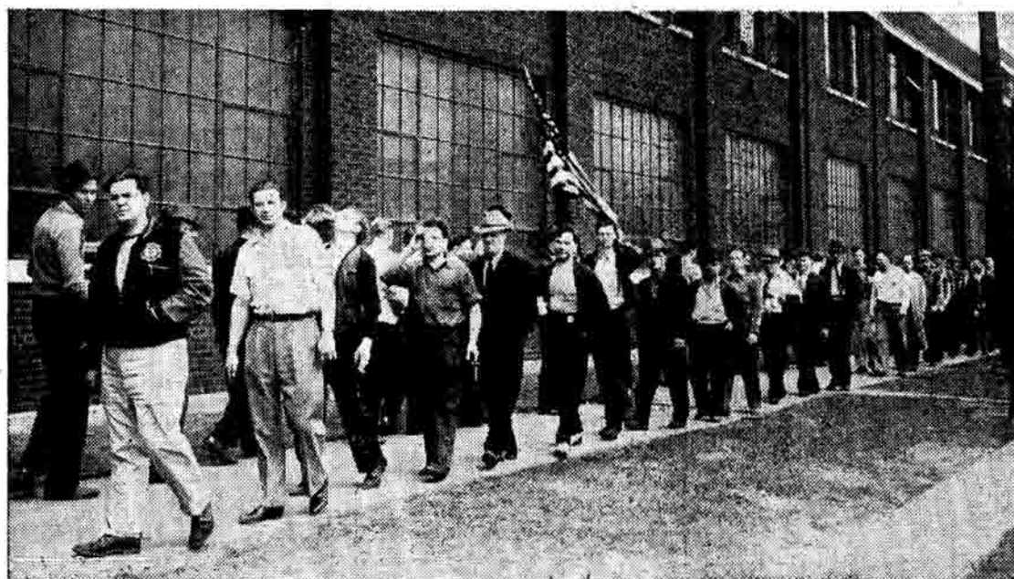
Striking members of the United Automobile Workers (CIO) picket the strike-bound main plant of the Ex-Cello Corp. in Detroit, where 3,000 workers have walked out to fight for a 10 cent hourly increase. The company has several million dollars worth of war orders for tools and parts.