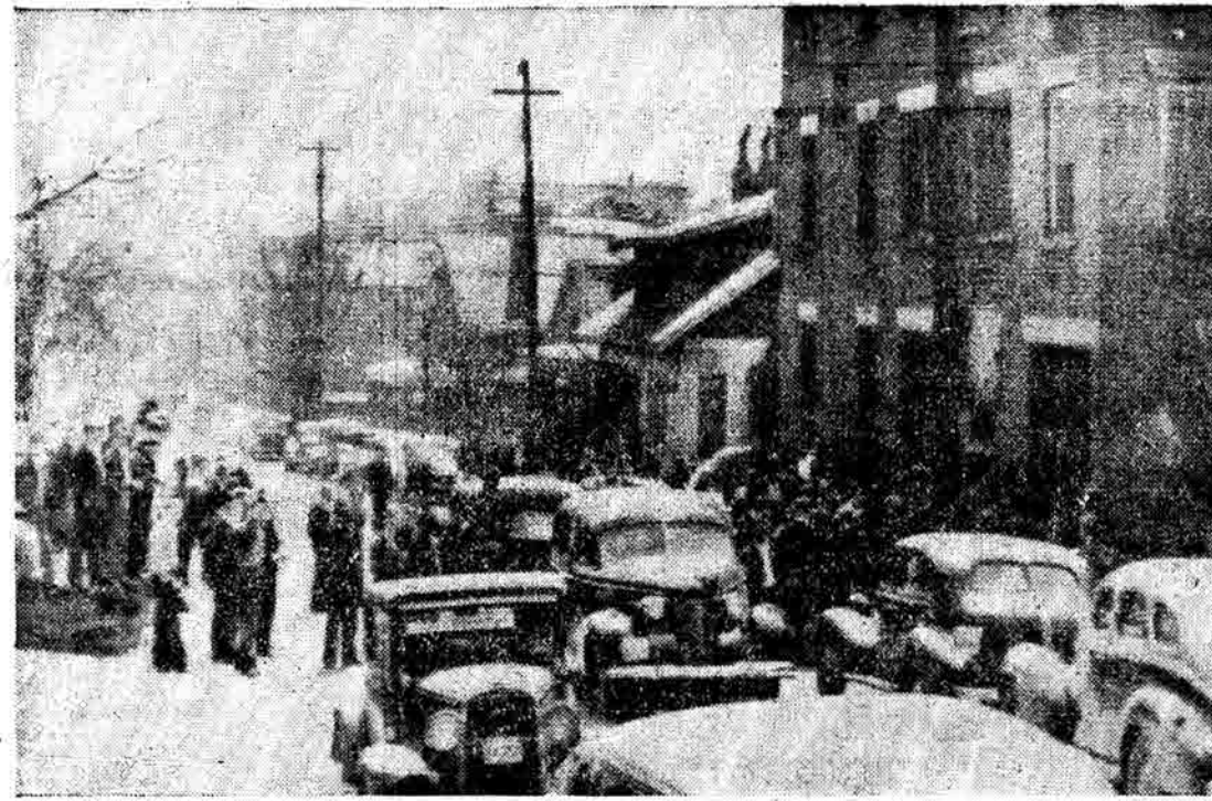
Scene outside the Harlan Hospital, Harlan, Kentucky, where striking members of the United Mine Workers (CIO) are gathered as four dead and five wounded union brothers are being brought in after being machine-gunned from ambush by mine guards and Bloody Harlan officials at the Crumme Creek Mine. Thus four more names are added to the long roll of martyrs whose sacrifices have helped build the UMW union in the United States.