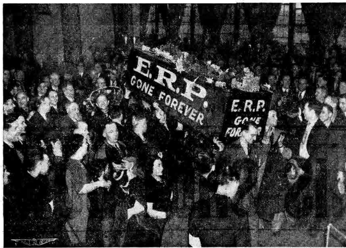
Bearing a coffin containing the "corpse" of the Employees Representation Plan, Bethlehem Steel's company union, jubilant members of the Steel Workers Organizing Committee (CIO) are shown celebrating at their victory meeting after their two-day strike at Bethlehem's big Cambria works in Johnstown, Pennsylvania.