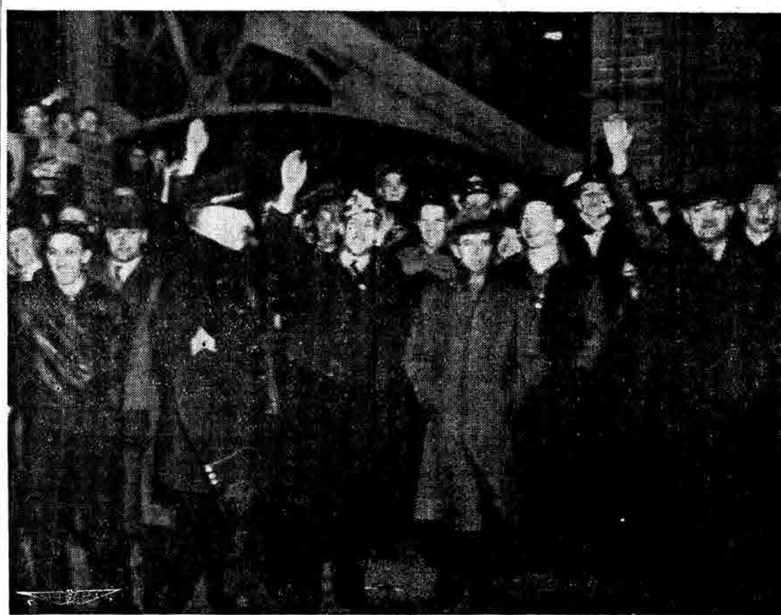
A group of Ford workers, massed at the foot of the stairs leading to one of the overpasses into the River Rouge plant, cheer the news that the Ford Motor Company strike has officially begun. Several of the workers are wearing the famous United Automobile Workers (CIO) caps.

Wednesday 12:15 A. M., fully nine hours after the original disturbance in the rolling mill, the