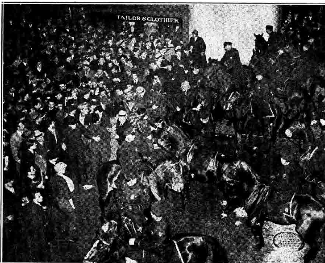
Here's how Mayor La Guardia's Cossacks protected the Fascist meeting, bottling the anti-Fascist workers in the sidestreets facing Eighth Ave. Several workers were hurt when the cops rode their horses into the crowd.