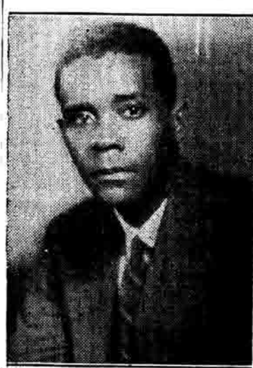
C. L. R. JAMES